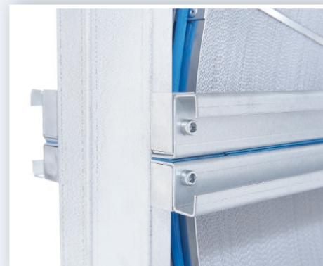
Small housing depth (wheel depth + 90mm) for example 200 mm + 90 mm