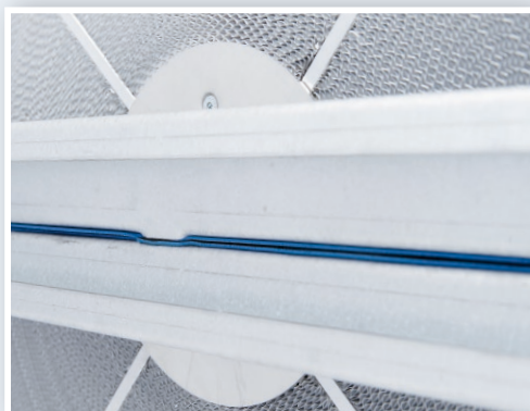
Highest air tightness on the market due to construction and new innovative twin-contact seal system